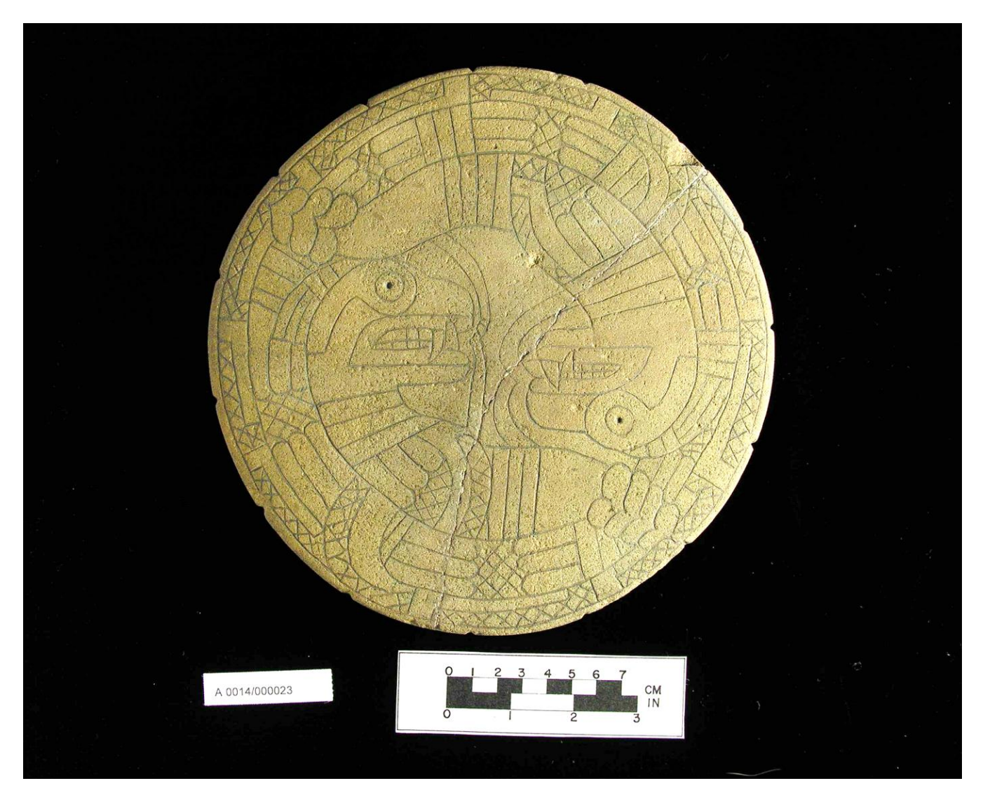
Figure 5 . Mississippian sandstone tablet with an engraved design incorporating two intertwined serpent creatures with rattle-snake tails and the opposing canine teeth of a mammalian carnivore, possibly a felid (Prentice 1986:245). These are typical of the "often-bizarre configurations of dragon-like creatures whose images invoke mystery and hidden knowledge" (Reilly and Garber 2007:2) that were an important component of the Mississippian artistic tradition. The tablet often is referred to as the "Issaquena Disk" for Issaquena County in Mississippi where it was found. Marshall Anderson collection, Ohio History Connection (A14/023).

Mound is another possible example as it is built on a prominent bluff just upriver from and in sight of the Newark Earthworks. Cook suggested that this was an intentional strategy of non-local Mississippians "to establish a connection to local traditions" (2017:118); and it provides a compelling explanation for why the Mississippians, or the Mississippianized Fort Ancient culture, would have built Serpent Mound in close proximity to existing Adena burial mounds.