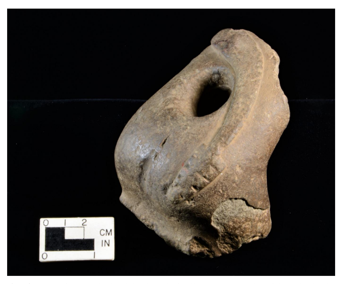
Figure 3 . Fragment of a Late Prehistoric period sandstone pipe found in Morgan County, Ohio, depicting a naked, kneeling human figure with a serpent extending diagonally across its back. The regrettably small portion of the sculpture that remains is consistent with other Mississippian representations of First Woman and her consort, the Great Serpent (Duncan and Diaz-Granádos 2018b:68). William Hook collection, Ohio History Connection (A76/001).

imperfectly transmitted between generations; ceremonies whose symbolism has changed to become supportive of new values; origin myths naturalized to new locations; ceremonial objects whose full significance was known only to elders who have died; the bones of Indians whose deaths silenced personal stories that await telling; buried artifacts that speak of technologies long forgotten; and earth constructions that speak of rituals long abandoned." Robert L. Hall (1997:169)