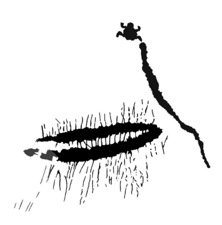
Figure 2 . A portion of Panel 3 from Picture Cave, Missouri, showing the three glyphs that correspond to the three principal elements of Serpent Mound as mapped by MacLean. The Great Serpent (Glyph 67), First Woman (Glyph 64), and the large oval vulvoid (Glyph 59) (Diaz-Granádos et al. 2015). These images are thought to be associated in a single composition not just because they are adjacent to one another, but also because they appear to have been painted with the same pigment and application technique. Drawing by Peter Lepper.

With regard to the wishbone-shaped earthwork at the head of Serpent Mound, Romain (2019:60) states