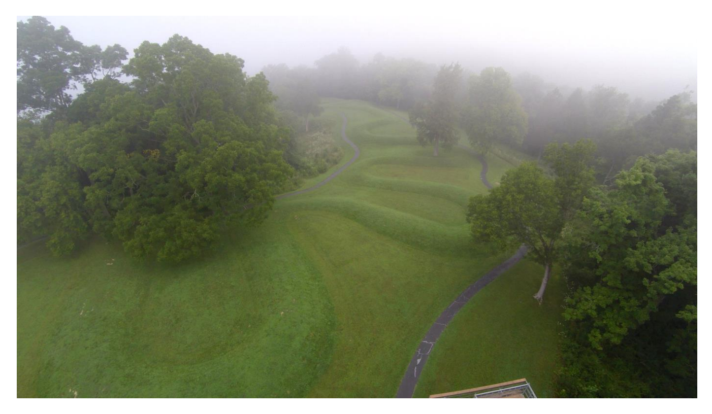
Figure 3. A drone's eye view of the Serpent on a foggy morning in August, 2016.

hilltops in the area would not have gone unnoticed. In fact, three prominent depressions occur just off the Serpent's tail.