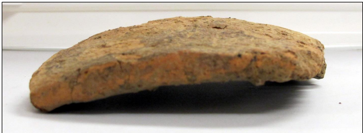
Figure 15: Rimsherd from refit Adena vessel.