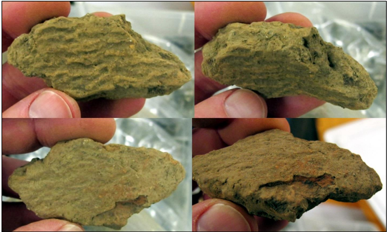
Figure 14: Interior cordmarked bodysherds with red exterior layer from Point Mound burial feature.