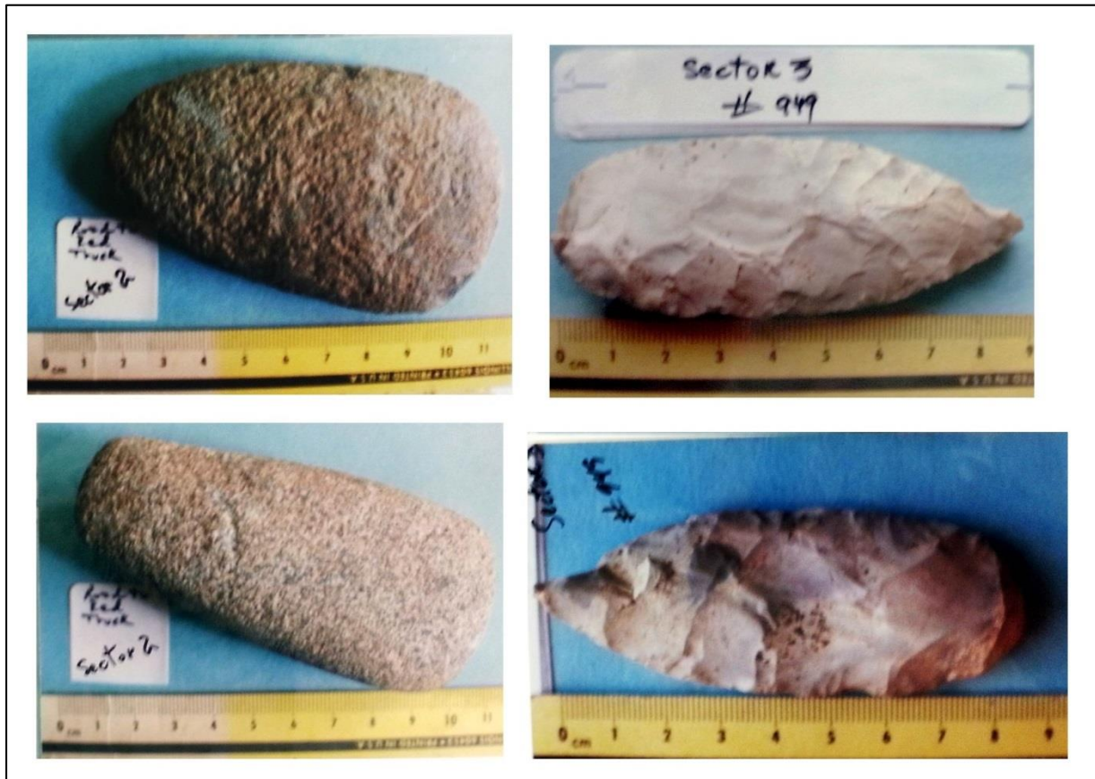
Figure 6: Sample of artifacts collected from the surface of the Oberling-Glenn Site by R. Scammyhorn.