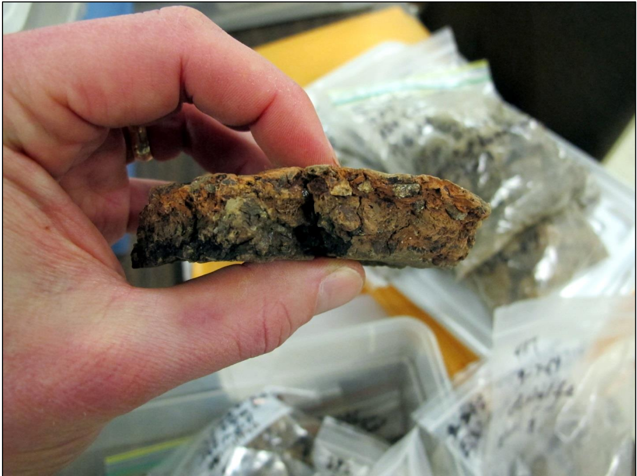
Figure 13: Bodysherd from the Point Mound burial feature.