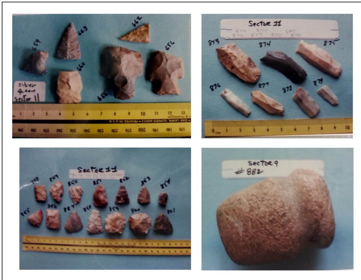
Figure 9: Sample of artifacts collected from the surface of the Oberting-Glenn Site by R. Scammyhorn.