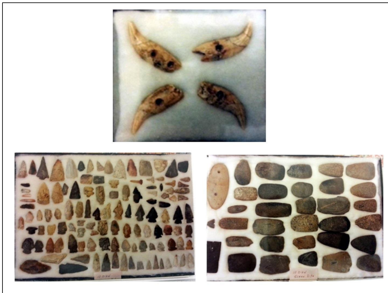
Figure 3: Examples of artifacts from the Oberting-Glenn Site in the Glenn Collection.

The “Spring Trench” is Scammyhorn’s investigation of the source of an apparent spring near the center of the southern portion of the enclosure. This investigation employed a backhoe and extended down to ~11 ft (~3.4 m) (Figure 19). Woodland artifacts were recovered from this feature at considerable depth (Figure 20).