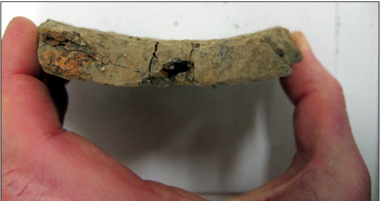
Figure 11: Rimsherd from the Point Mound burial feature showing the lip surface.