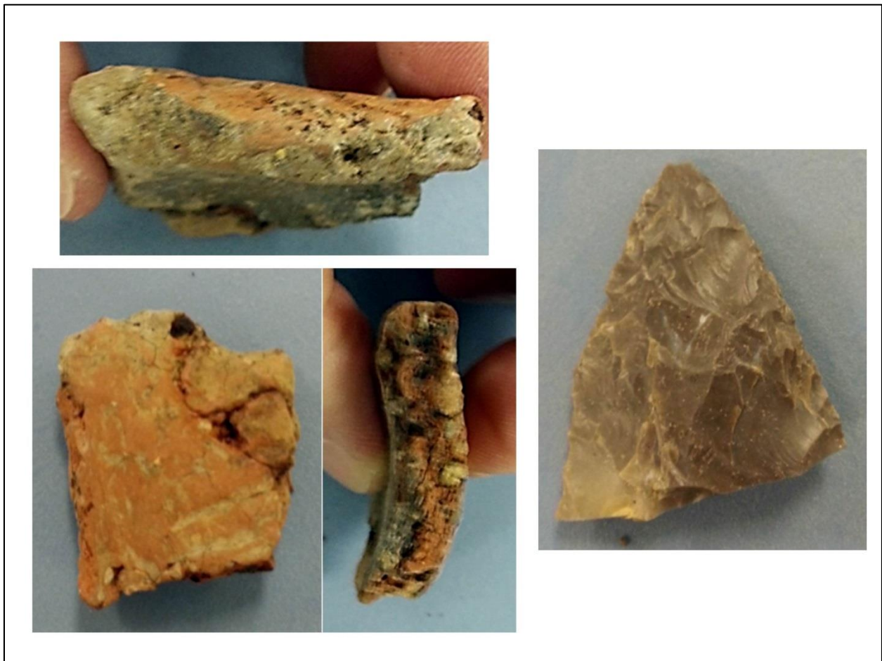
Figure 20: Artifacts recovered from Spring Trench excavation. Left are three views of a single rimsherd recovered from the west wall of the trench on November 24, 1985 at a depth of 4.5 ft (~1.4 m). Right is a biface recovered May 17, 1986 at a depth of 7.84 ft. (~2.4m), possibly made of Wyandotte chert.