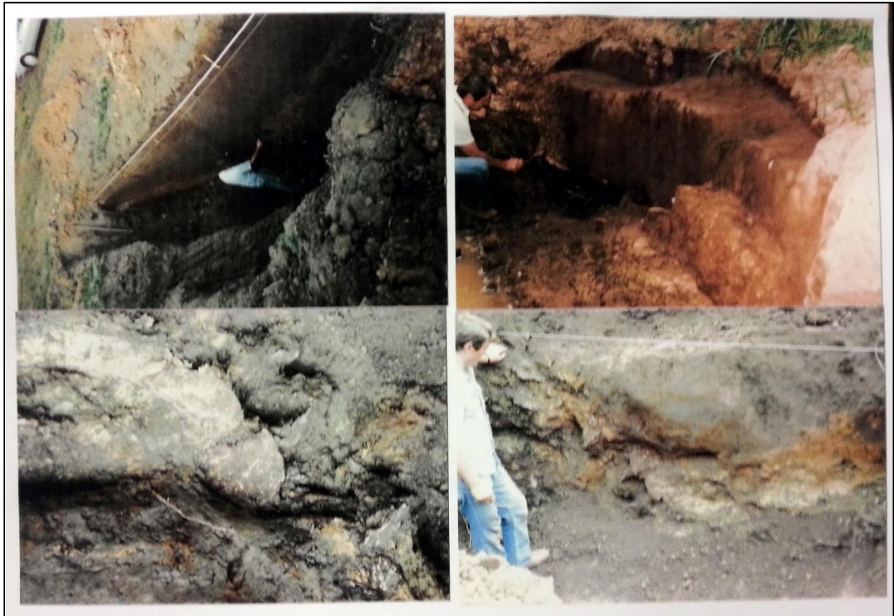
Figure 19: Spring Trench excavations.