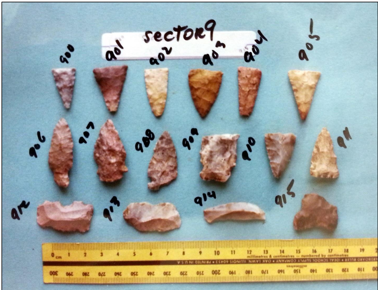
Figure 8: Sample of artifacts collected from the surface of the Oberting-Glenn Site by R. Scammyhorn.