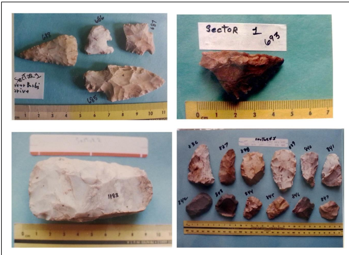
Figure 5: Sample of artifacts collected from the surface of the Oberling-Glenn Site by R. Scammyhorn.