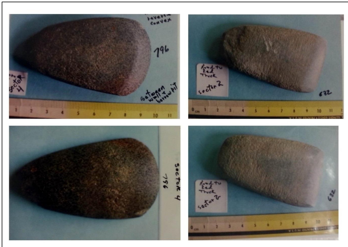
Figure 4: Sample of artifacts collected from the surface of the Oberting-Glenn Site by R. Scammyhorn.