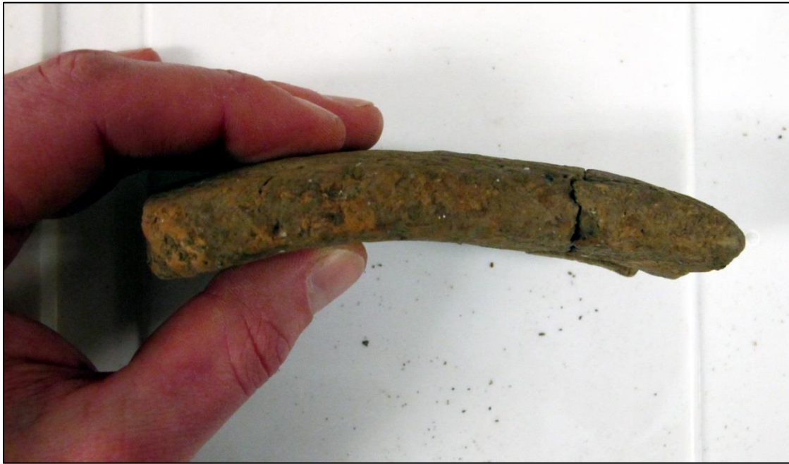
Figure 10: Rimsherd from the Point Mound burial feature showing lip surface.