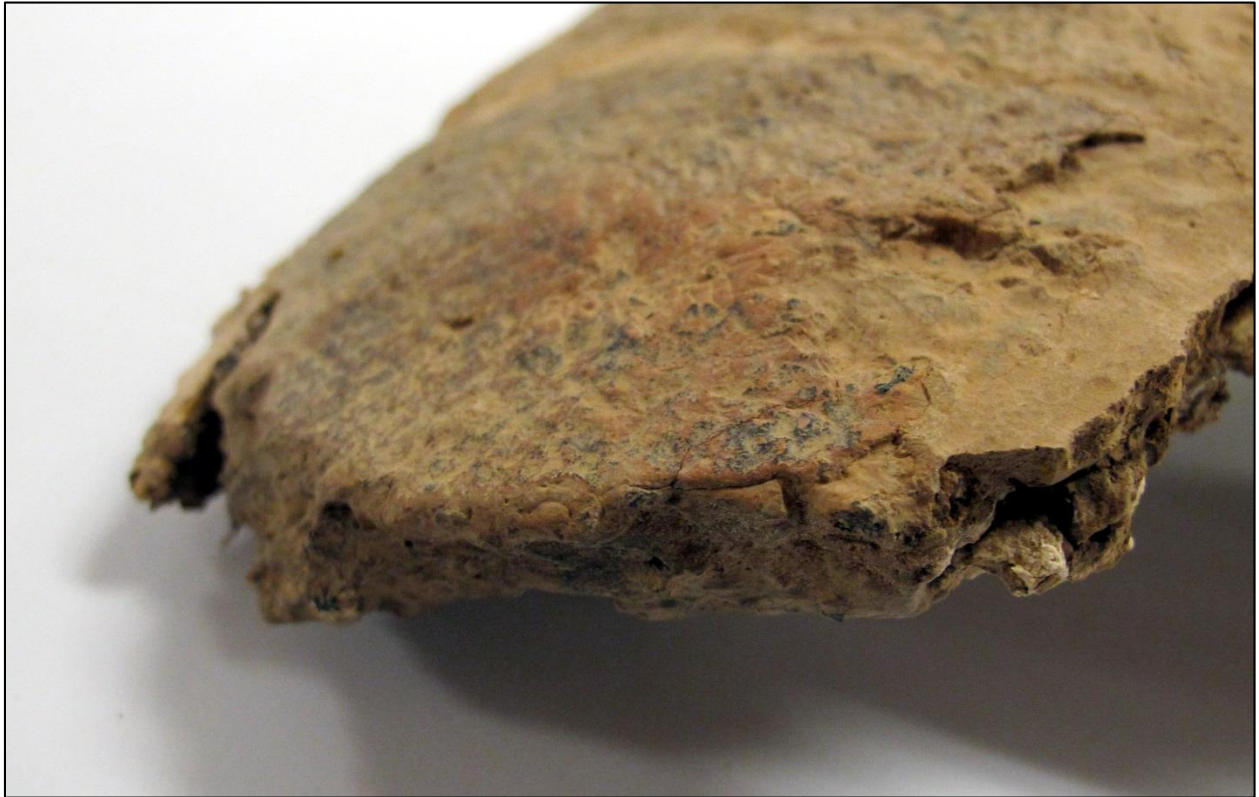
Figure 18: Close-up of reddish coloration on refit Adena vessel. (See Figure 17 for context.)