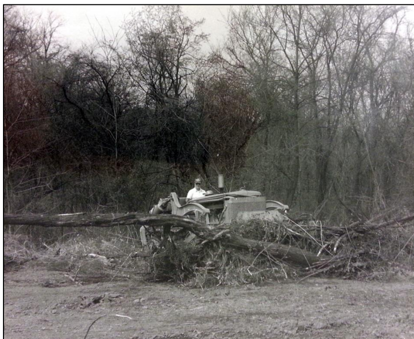
Figure 1: Clearing of the West Wall Area in 1980(?).

The earliest notes seem to indicate that investigations started in the late 1970s and continued into the mid-1980s, with some later work, in 1993, at least reestablishing damaged datums. Notes on one of the maps dated September 25, 1981 indicate that the land had been "farmed into the early 1900s and fauna both wild and domestic inhabited the entire hilltop. The site has been disturbed extensively during the past 10 years by the owner clearing the hill top of trees and grape vines and other wild flora..." (Scammyhorn n.d.). Another note indicates that Scammyhorn visited the Glens to photograph their private collection in 1976 with Charles Oehler (then Curator of Archaeology, CMNH). The location and condition of the Glenn collection is unknown, and only Scammyhorn's notes and photographs of the collection are in the possession of the CMC. Genheimer (personal communication, December 2013) believes that Scammyhorn's initial investigations were a sort of salvage required by damage caused by land clearance activities. Indeed some of the photographs show heavy equipment being used to clear brush from the surface (Figure 1). This event appears to be Scammyhorn's earliest direct involvement with the site.