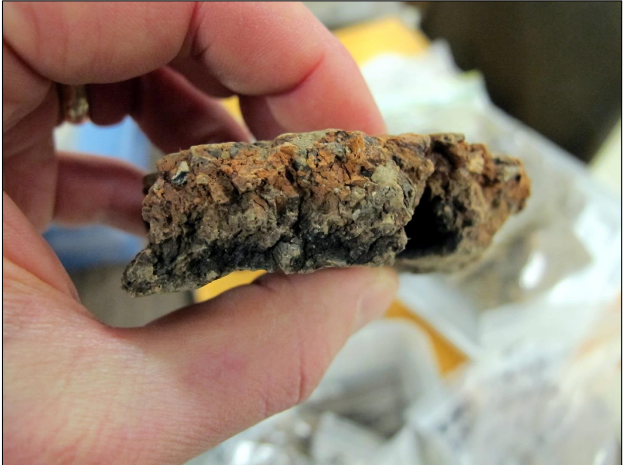
Figure 12: Bodysherd from the Point Mound burial feature.