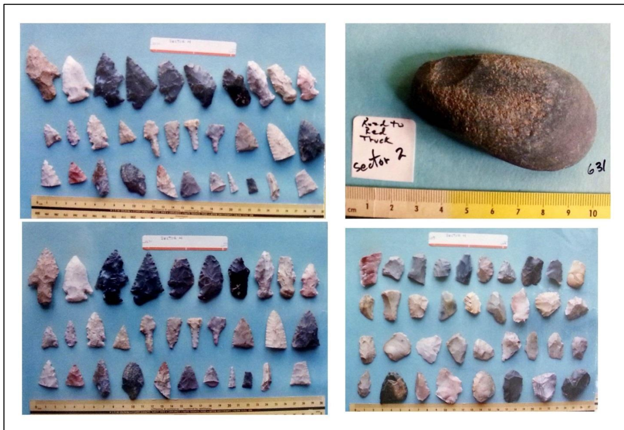
Figure 7: Sample of artifacts collected from the Surface of the Oberting-Glenn Site by R. Scammyhorn.