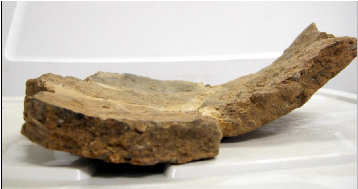
Figure 16: Profile of refit section of Adena vessel.