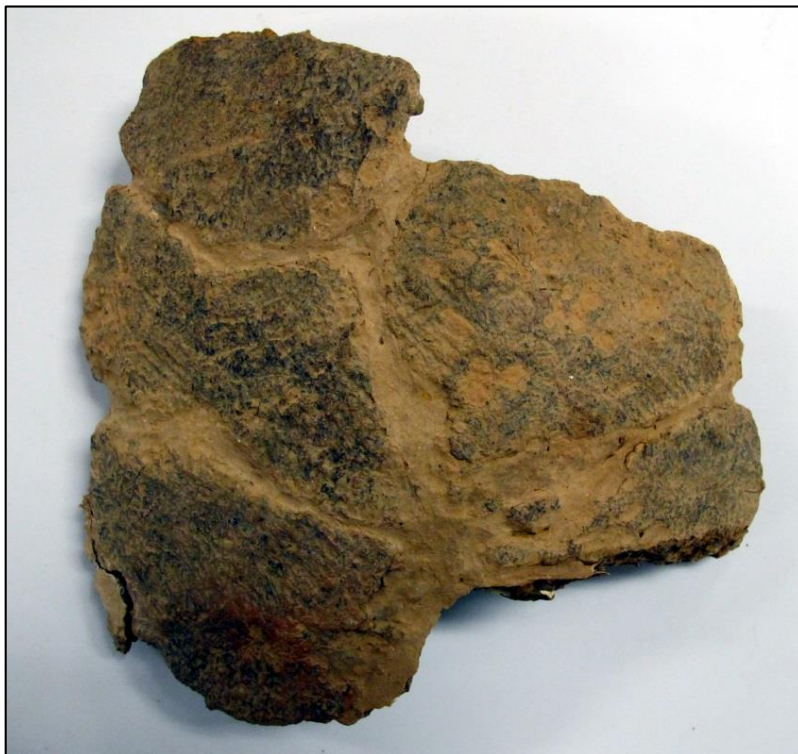
Figure 17: Exterior of the refit Adena vessel section.

(Note reddish orange color on the bottom left. See Figure 18 for close up.)