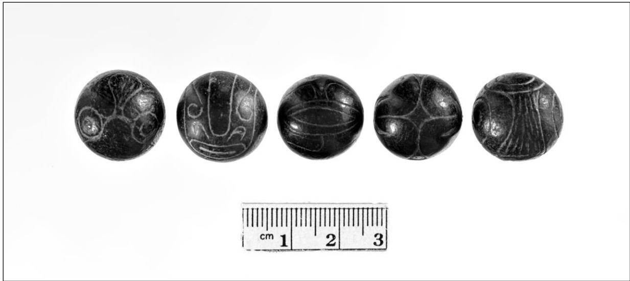
Figure 2. Set of five steatite spheres ranging in size from 18.8 to 19.5 mm in diameter and weighing between 10 and 11 g each. According to Shetrone and Greenman (1931:424), "the five steatite spheres... were found in the Burnt Offering, adjacent to Burial 13, which was the cremation of a child..." They argued that "this coincidence suggests that these engraved spheres were used as marbles and that they had been intended for the remains of the child." Elsewhere in their report, however, they acknowledged that "Burials 13, 14 and 15 rested upon the surface of [the Burnt Offering]... but were not otherwise related to it" (Shetrone and Greenman 1931:378). Therefore, there is no reason to think that the stone spheres had any direct connection with Burial 13.

Ben and I presented the preliminary results of our collaboration at the Ohio Archaeological Council's May 2016 Third Conference on Hopewell Archaeology. We presented an extended version of that paper the following year for the Glenn Black Laboratory of Archaeology and the Mathers Museum of World Cultures and that presentation was videotaped and is available to view at https://www.indiana.edu/~gbl/thedirt/wordpress/?p=111 . Our research was published online in March 2018 in Archaeologies , the journal of the World Archaeological Congress: https://link.springer.com/article/10.1007/s11759-018-9334-1