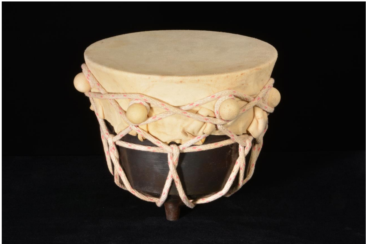
Figure 3. Shawnee water-drum assembled by Ben Barnes. Each of the bulges around the circumference of the drumhead contains a black, spherical pebble. We suggest that a Hopewell water-drum would have looked similar though the drum shell would have been made of wood or ceramic.