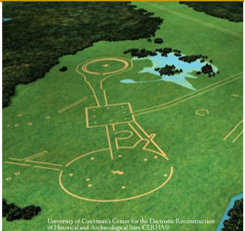
University of Cincinnati's Center for the Electronic Reconstruction of Historical and Archaeological Sites (CERHAS)

New Russia Township Lodge 46300 Butternut Ridge Rd. Oberlin, Ohio 44074